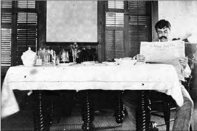
Galveston, 1897 — Read this issue's editorial for details.